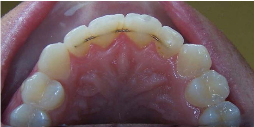
Lingual Bonding On The Upper

For patients that have severe crowding or spacing, it is necessary to bond a wire on the lingual of the upper or the lower incisors to maintain the alignment of the teeth or to maintain space closure. The composite must be of adequate thickness so that it will not wear off over a brief period of time. It is also contoured for self cleansing and must be bonded somewhat low toward the papilla on the upper if there is a deep overbite.